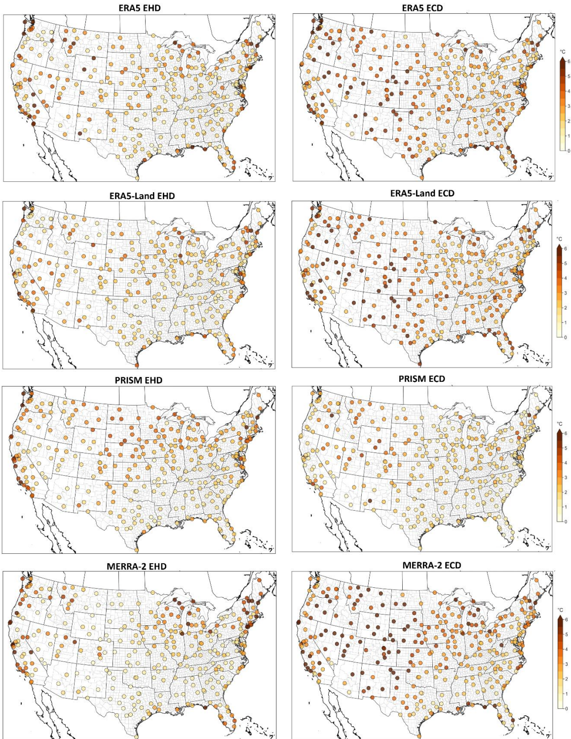
Figure 1. Mean absolute error of extreme heat days ( >95^{\text{th}} percentile) (left 4 panels) and extreme cold days ( <5^{\text{th}} percentile) (right 4 panels)