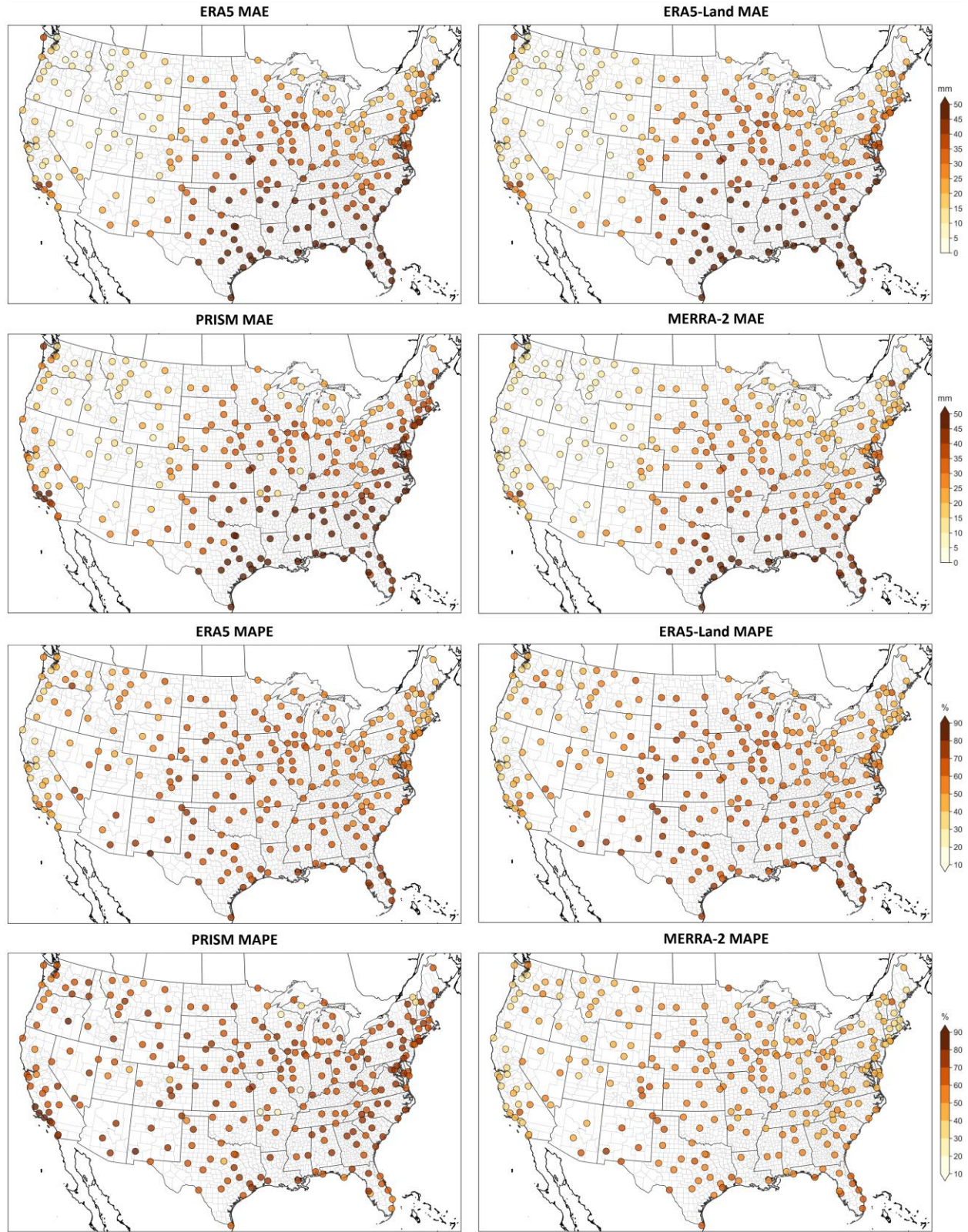
Figure 3. Mean absolute error (left 4 panels) and mean absolute percentage error (right 4 panels) of heavy precipitation days (>95 th percentile) between gridded datasets and stations