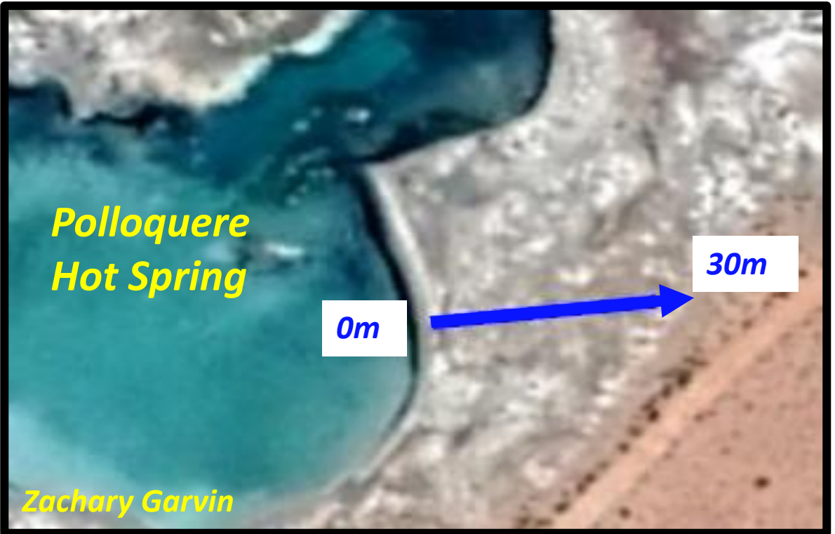
Figure 2 PQ Hot Spring, 30m sampling site