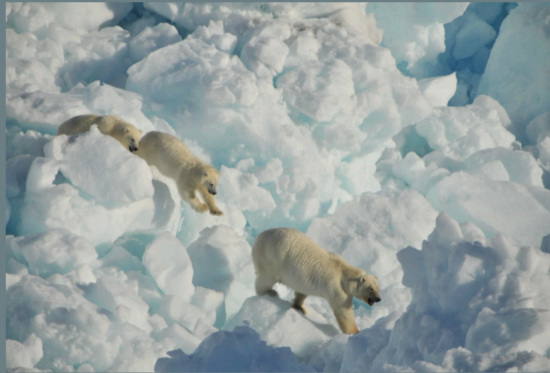
Figure 4. Polar bears on glacial ice. Photograph demonstrating polar bears' use of glacial ice.

Fjord ice-cover can provide an important platform for marine mammal activities. With our carefully digitized fast ice and glacial ice datasets we are able to look at how glacial ice may alter the fjord ice-cover season.