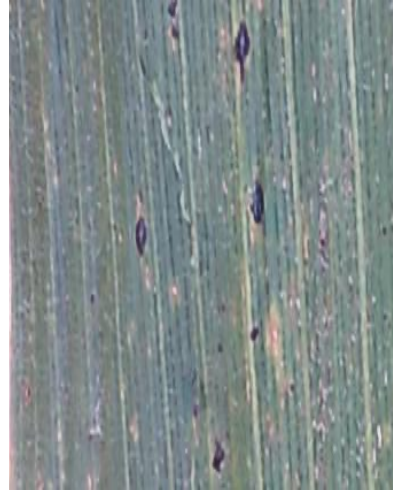
Example image in dataset