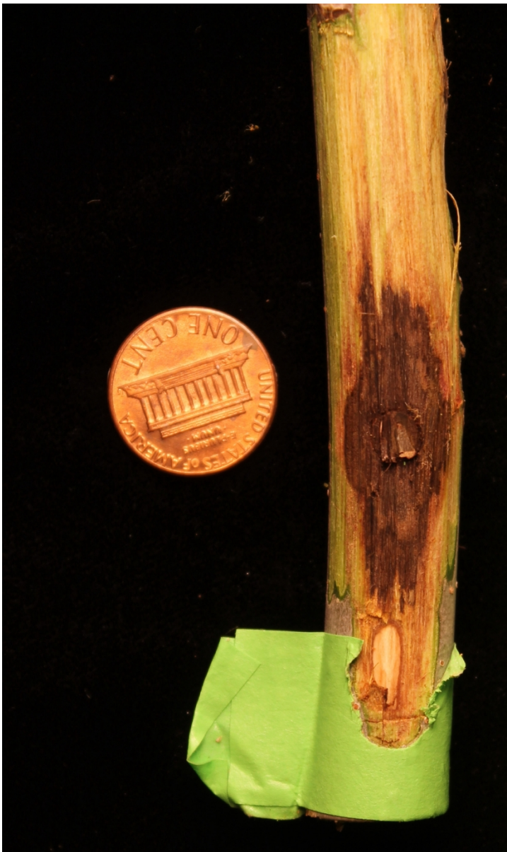
Appendix Figure A1 (a)