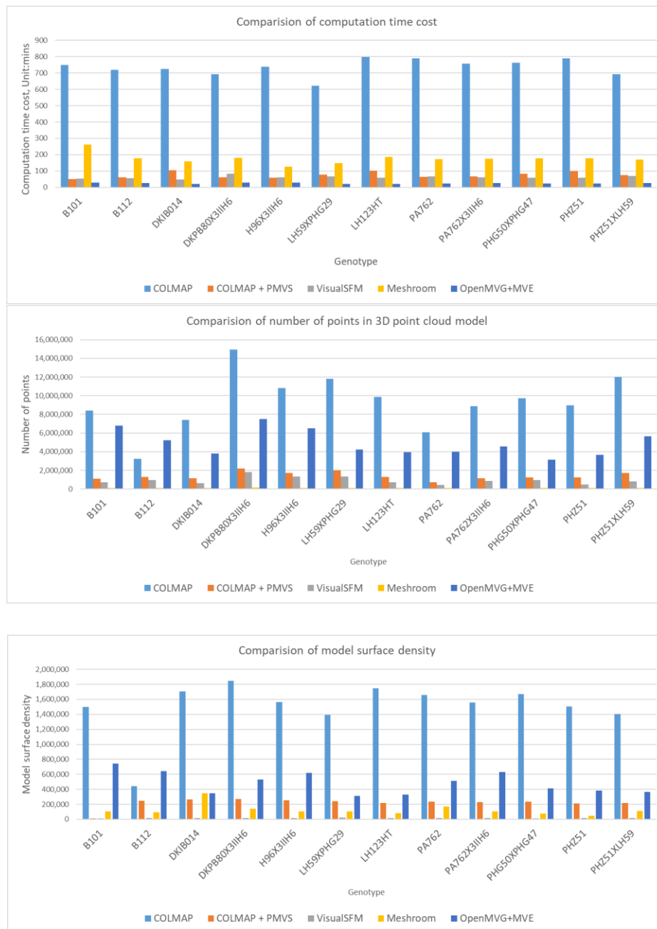
Figure 3. Comparison of time cost, number of points and surface density of 3D models

Our initial study is a good indicator, however further experiments are needed evaluate the quality of root traits and whole root descriptors to a manually measured ground-truth for a larger amount of 3D models. In that way, we will gain insight into the dependency of trait measurements on method accuracy.