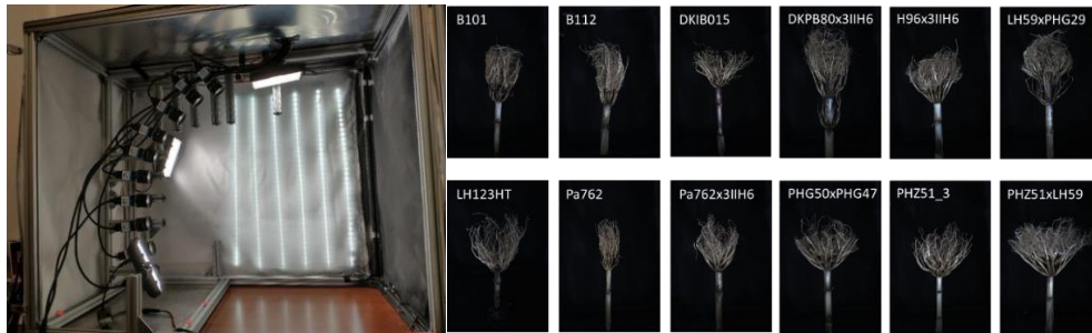
Figure 1. 3D root imaging chamber.

We captured images of each root sample with a prototype imaging chamber conceptually introduced in [25] (Fig. 1). Images were captured by ten cameras (Image Source DFK 33ux183 USB 3.0, 12mm focal length V1228-MPY2 12 Megapixel Machine Vision Lens) arrayed around a central focal point. Image capture is synchronized by a cluster of ten Raspberry Pi 4's using a server-client design. For each sample, between 301 and 360 images with image resolution 5,472×3,648 were captured using a manual rotation stand. Sample images for each genotype are shown in Figure. 1.