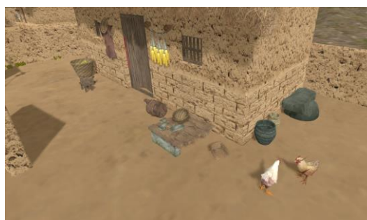
Figure 6. Details of some scenes