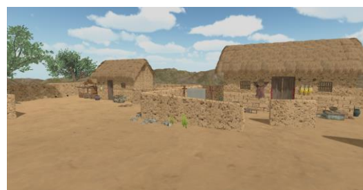
Figure 5. Scene of North Courtyard