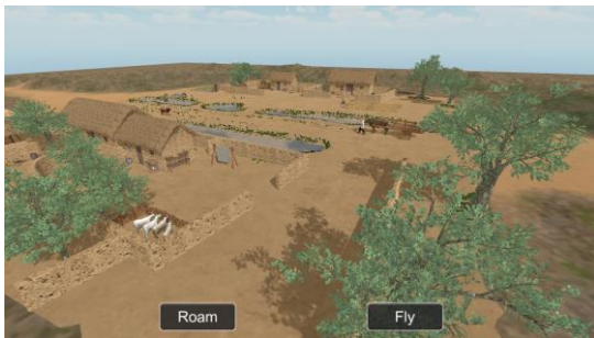
Figure 7. Interaction interface of scene

In this study, the interactive displaying interface of the relic restoration is developed based on NGUI plug-in which is the powerful UI component. Firstly, the NGUI plug-in is imported into the Unity 3d project. Secondly, interactive buttons are created according to the requirements. Finally, the C# script is created and the script is bound to canvas to write code to realize the interactive function. The interface is shown in Figure 7.