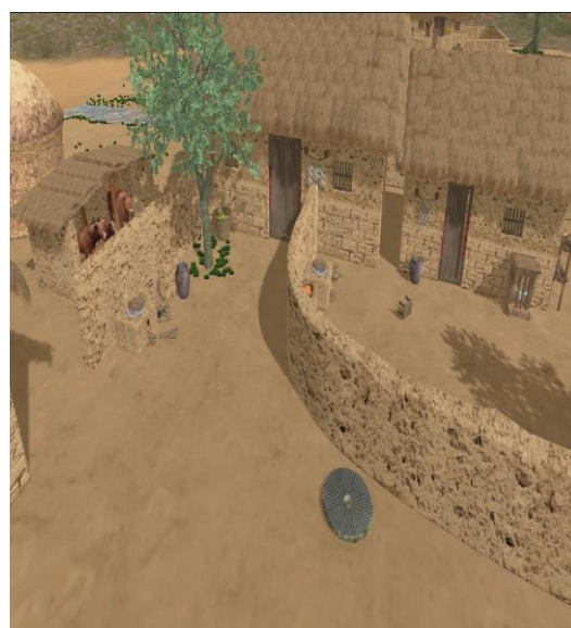
Figure 4. Scene of the Southern Courtyard

Speedtree is a professional modeling software that can create custom tree models. The tree models can be directly imported into Unity 3d by Speedtree for Unity plug-in. The scene lights can be set up after the building models and terrains were putted in the right position in Unity 3d. Unity 3d provides simple natural light source. To ensure that the brightness of the whole scene can't be too intensity, it is necessary to add a directional light source as the main light source of the scene. The light settings in the whole scene play an important role in the rendering of the later scene and the user experience [15]. Some scenes of the Qing Dynasty relics in Xinzheng are shown in Figure 4, Figure 5 and Figure 6.