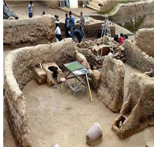
Figure 2. Courtyard ruins

courtyards of East and West were cleared out. Abundant building materials, farm implements, kitchenware, tableware, supplies and other relics were unearthed [11]. Some of the remains are shown in Figure 2, The remaining houses, walls and cooking ranges in the picture, including the chicken coop on the left side of the front door, can be seen clearly, which provides a basis for the restoration of the vestige scene.